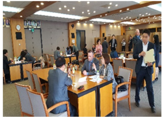
Business to Business meetings at World Trade Center, Seoul, S. Korea