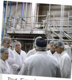
Pre-Employment Training Program