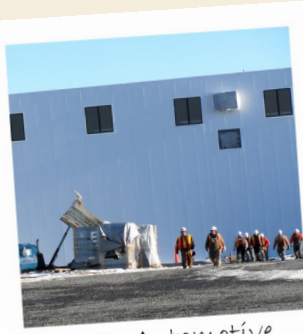
SGL Automotive Carbon Fibers