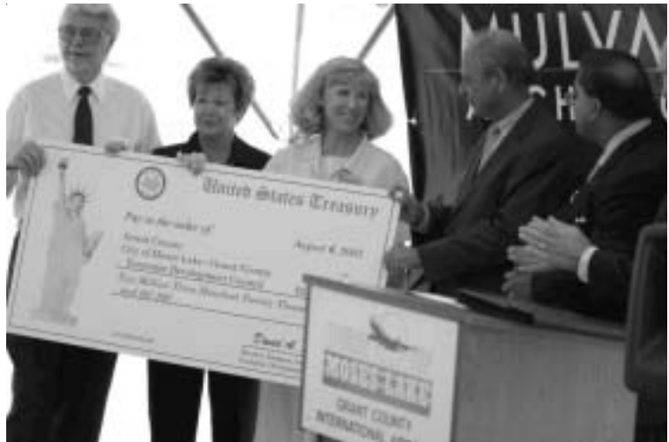
A $2.32 million check, a sizable push towards economic development, as it is accepted by representatives from the County, City of Moses Lake and Grant County EDC.

A sign presently marks the area where the project will be taking place. Efforts to recruit businesses to move into the project area are already underway. The EDA has provided the community with the fuel to make the recruitment machine run. This counts as a major development tool offering great potential for Grant County.