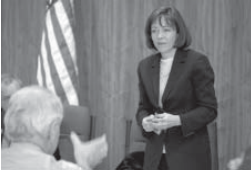
Senator Maria Cantwell meeting in Grant County to discuss the local economy in December 2002.

efforts. Action steps taken now will reap benefits for years to come.